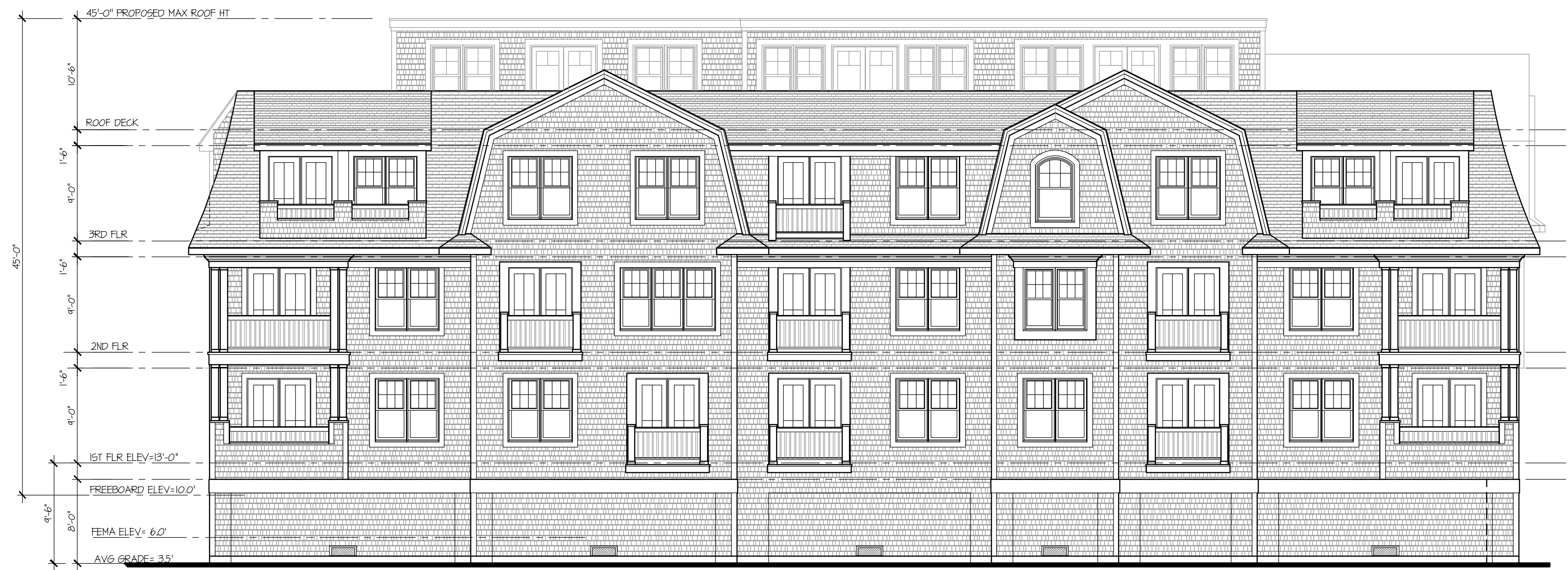
A PROPOSED WEST ELEVATION E203 SCALE: 1/8" = 1'-0"